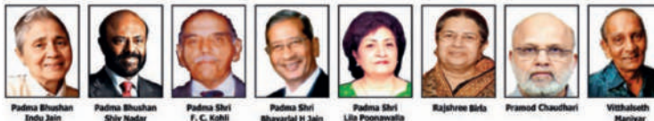
Padma Bhushan Indu Jain