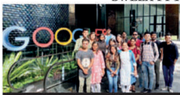
Industry Visits / Global Immersion Program

For more details visit : https://www.suryadatta.org/wp-content/uploads/2026/01/SWELA-PPT